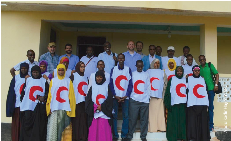
Group photo of ICRC and SRCS staff together with volunteers during the inauguration of the new SRCS branch in Huddur.