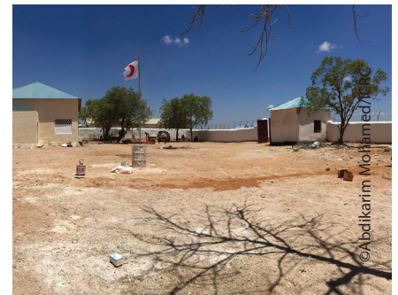
Ongoing construction works at the SRCS branch office in Huddur. The rehabilitation was supported by the ICRC.