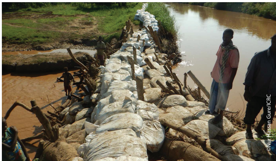
Sandbags are piled along the River Shabelle where the waters broke through. Sandbags were distributed by the ICRC before the onset of the Deyr rains to manage the river flow

The submerged roads were an additional and daunting challenge for the ICRC and SRCS.