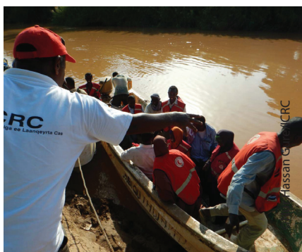
ICRC and Somali Red Crescent Society (SRCS) teams arrive by boat at a village in Middle Shabelle to carry out a food distribution. Access was a challenge for the teams because area roads were submerged

Seasonal Deyr rains caused a rise in the Shabelle river, resulting in widespread floods that washed out roads, isolating the riverine communities hardest hit by the rains.