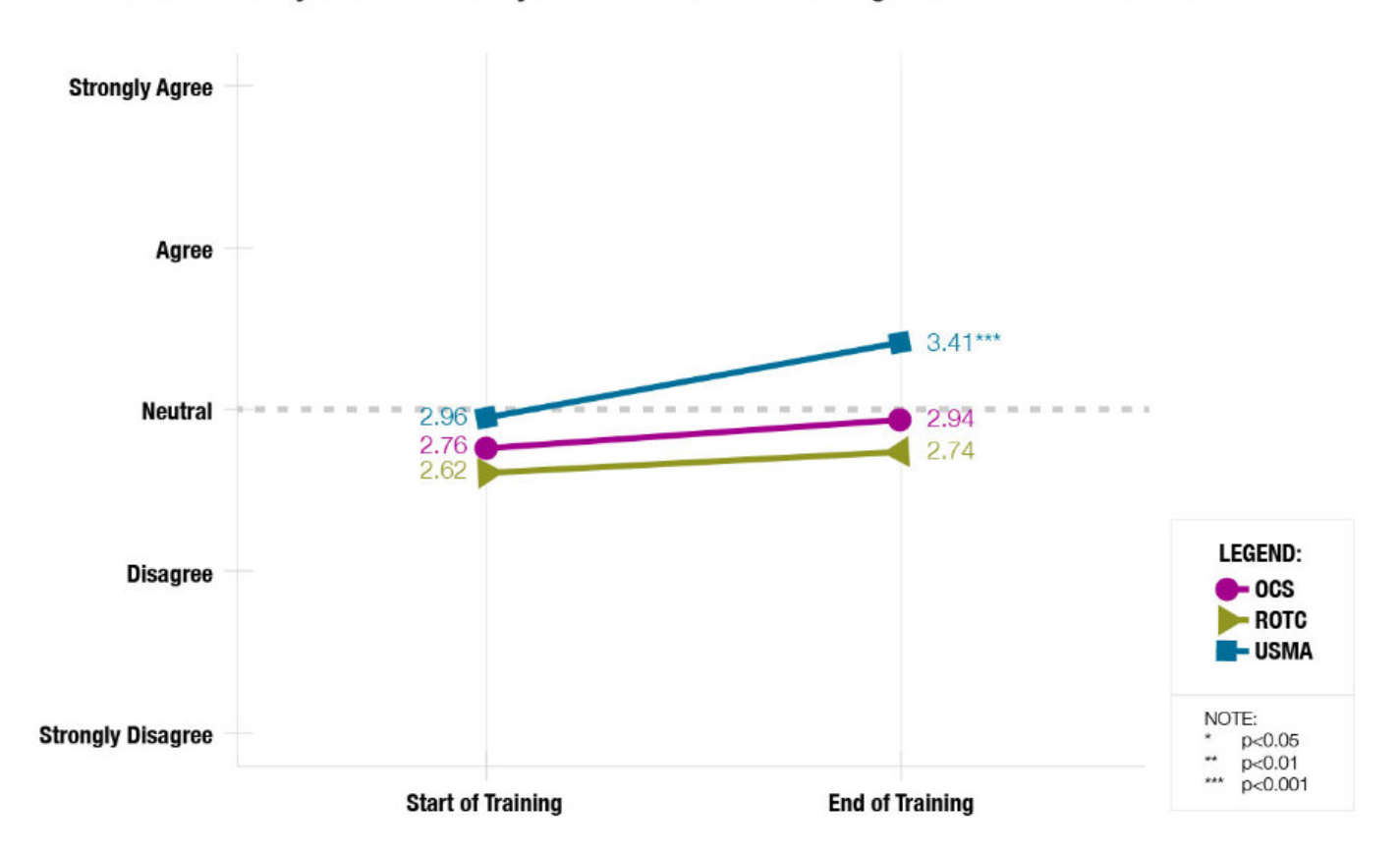
Figure 1. "I would risk the safety of members of my unit to limit 'collateral damage' deaths of civilians on the battlefield."

The results of this research demonstrate two important points: first, IHL training can influence military attitudes, even at relatively low levels of intensity. While this training produced little effect in dilemmas balancing civilian protection with force protection, low-intensity training produced greater emphasis on restraint in scenarios balancing military objectives against civilian protection. Thus, even low-intensity IHL training can achieve effects in shaping combatant attitudes toward civilians.